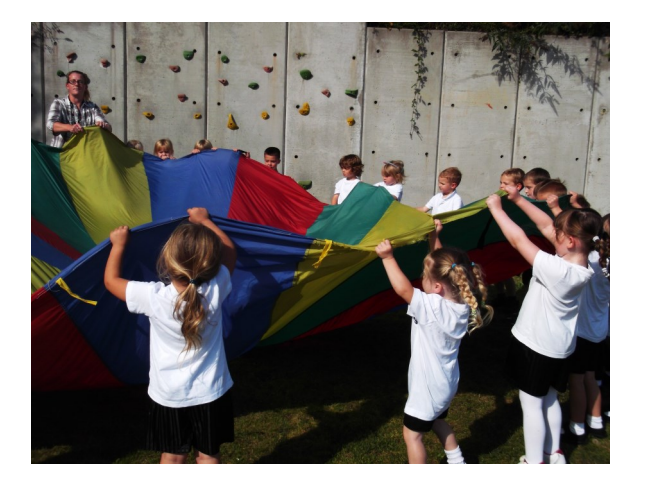
Expressive Arts & Design

Children have access to the art area, music area, dance, role play and imaginative play. Creativity is fundamental to successful learning. Being creative enables children to make connections between one area of learning and another.