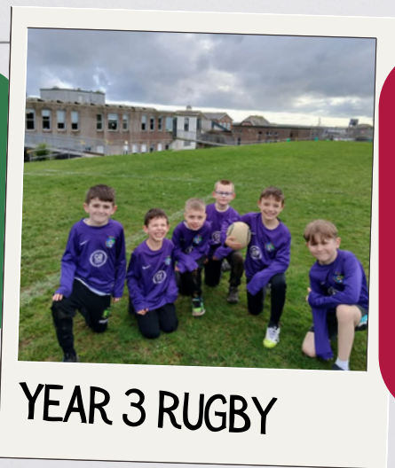
YEAR 3 RUGBY

A small group of Year 3 pupils enjoyed a rugby afternoon at Poltair School earlier this week as part of our ongoing partnership. They learnt new skills, took part in fun activities and showed great teamwork and enthusiasm. We are very proud of how well they represented our school - thank you to Poltair School for hosting such an enjoyable event.